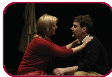
A scene from I Am Green , the play that Somalia directed