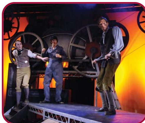
BA Acting students make use of a magnificent set for The Machine Breakers at The Corbett Theatre

Also away from The Corbett Theatre, third-year BA Contemporary Theatre students made use of innovative Isle of Dogs theatre, The Space, for their productions of Attraction to Atrocity and Round Round .