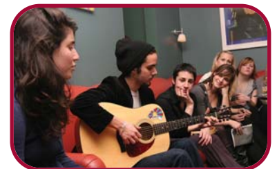
East 15 students provided entertainment at World Performance launch

BA World Performance is a unique and radical step away from traditional university or drama school programmes. No other UK institutions offer a similar scheme, as it combines a study of performance traditions and approaches from across the world. It is aimed at students who have an interest and skills in performance but may not want to become an actor. It would also be suitable for students drawn towards performing arts and theatre programmes at universities and academies with a strong performance tradition.