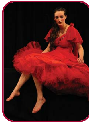
Touring shows by BA Contemporary Theatre students were well received

Aimed at older members of the family, BA Contemporary Theatre students performed Food for Masses and The Inconsiderate Aberrations of Billy the Kid . Both productions were so well received that the Barbican Centre in London is now looking at staging The Inconsiderate Aberrations of Billy the Kid next year!